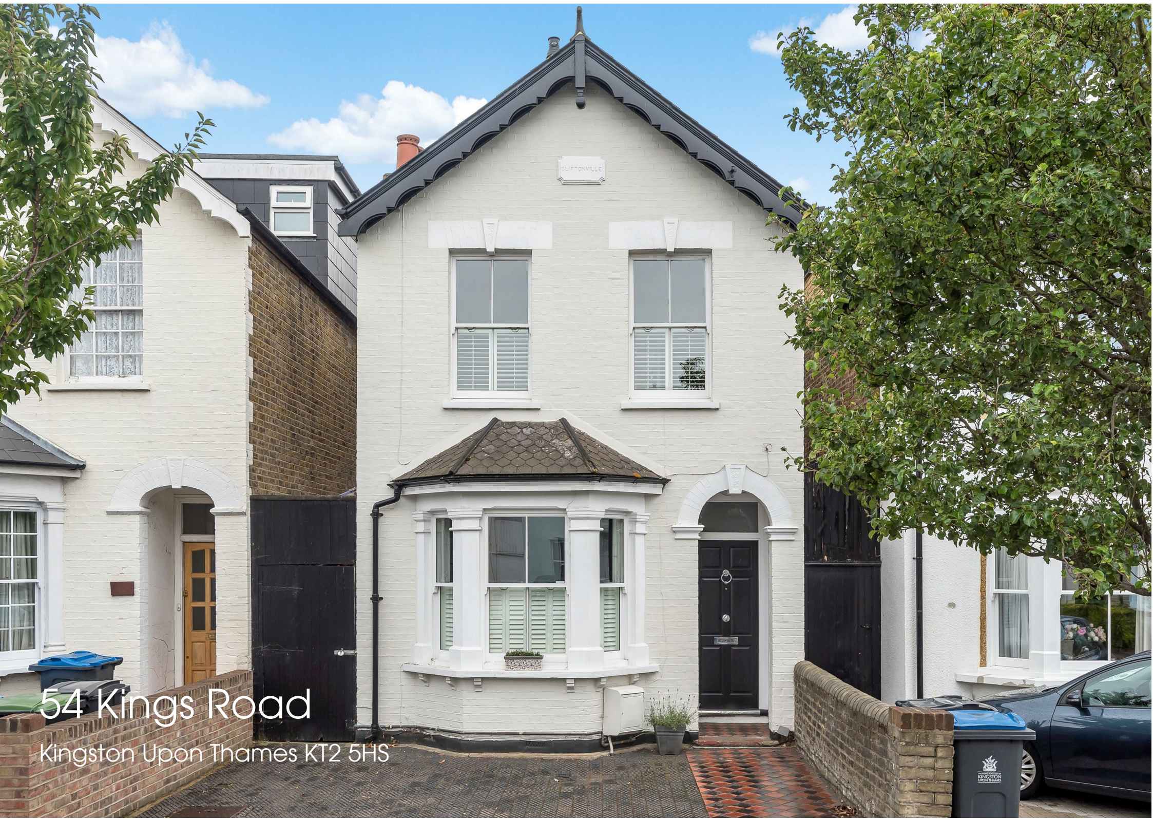
54 Kings Road Kingston Upon Thames KT2 5HS